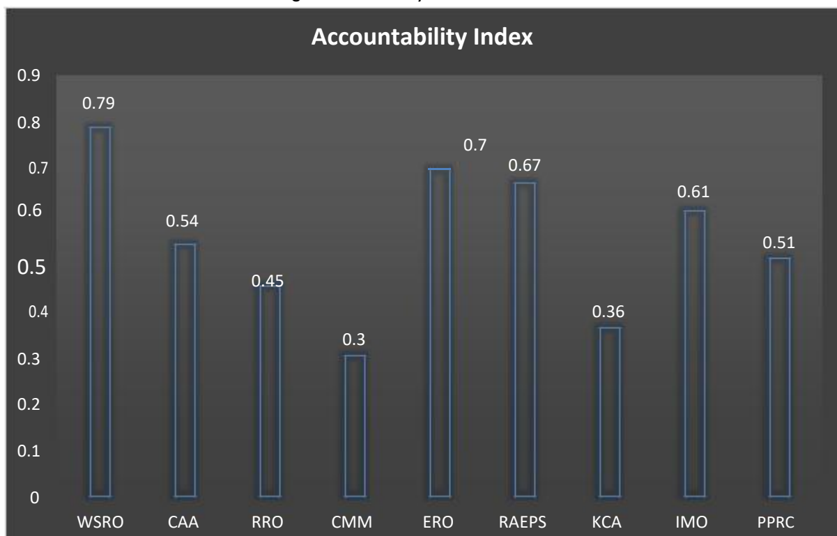
Fig.1 Accountability of IRAs in Kosovo

The data in fig. 1 suggests that no regulator scores lower than 0,3 or higher than 0,79. As shown in the figure below, the highest score belongs to the Energy Regulatory Office (0,87), and Water Services Regulatory Authority (0, 79), the Civil Aviation Authority (0,70) followed by the Regulatory Authority of Electronic and Postal Communications (0,67), and the Independent Media Commission (0,61). The Commission on Mines and Minerals scored the lowest (0,38), followed by the Kosovo Competition Authority (0,36), Railway Regulatory Office (0,45), Public Procurement Regulatory Commission (0,51), and. The average accountability index is 0, 59, indicating only moderate accountability amongst IRAs on average. This score indicates accountability challenges spread throughout various indicators. These challenges also lead to low performance and efficiency in the IRAs work.